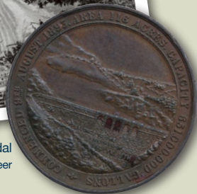
Commemorative medal Donated by a volunteer